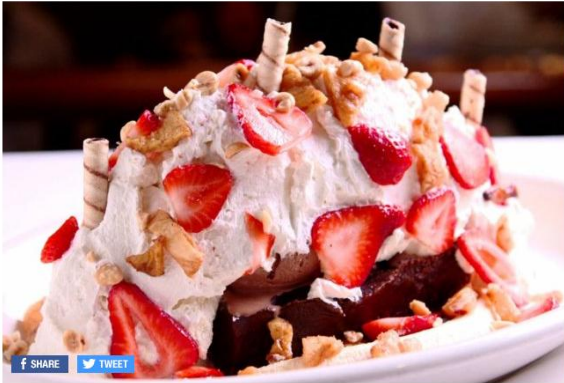
The Titanic Sundae has but 10 "softball"-sized scoops of ice-cream. Good luck.