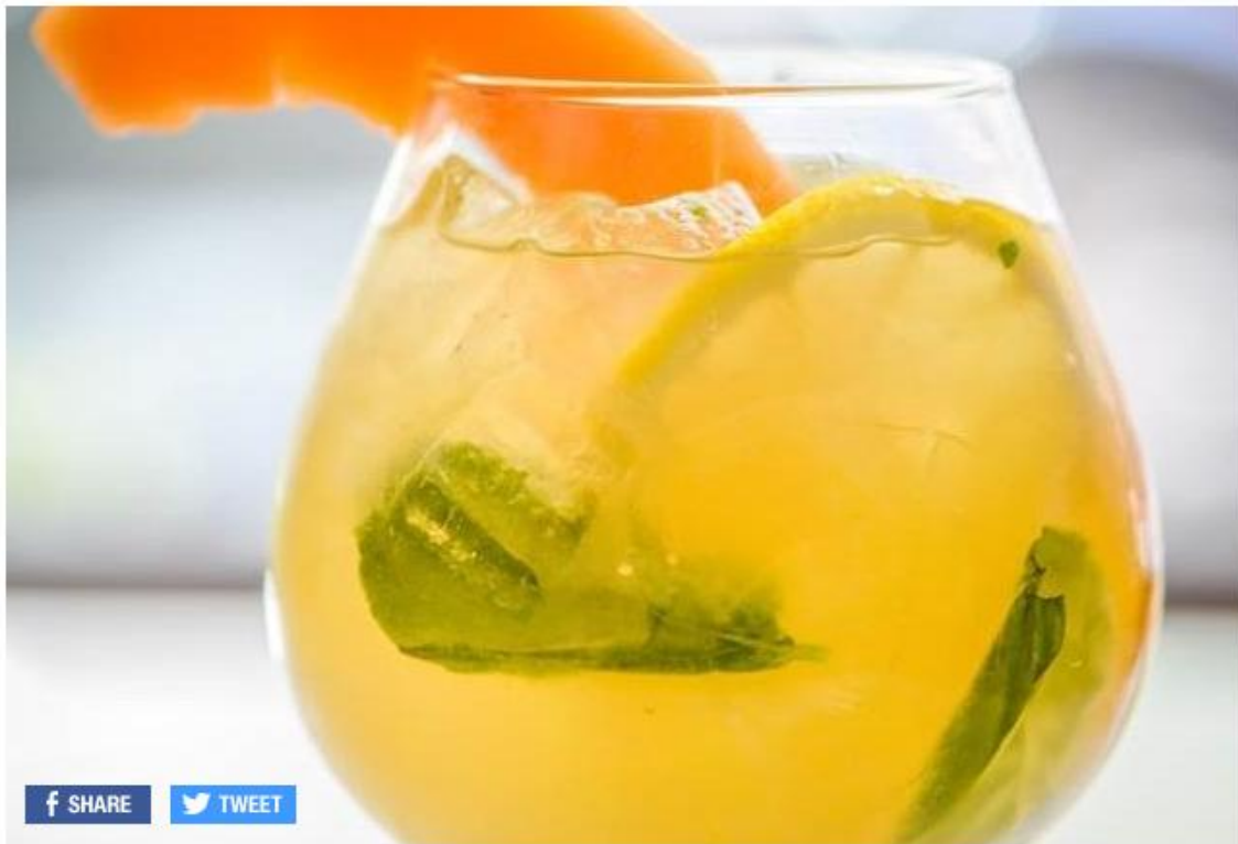
Family-style drinking! Get the sangria made with cantaloupe & blanco vermouth.