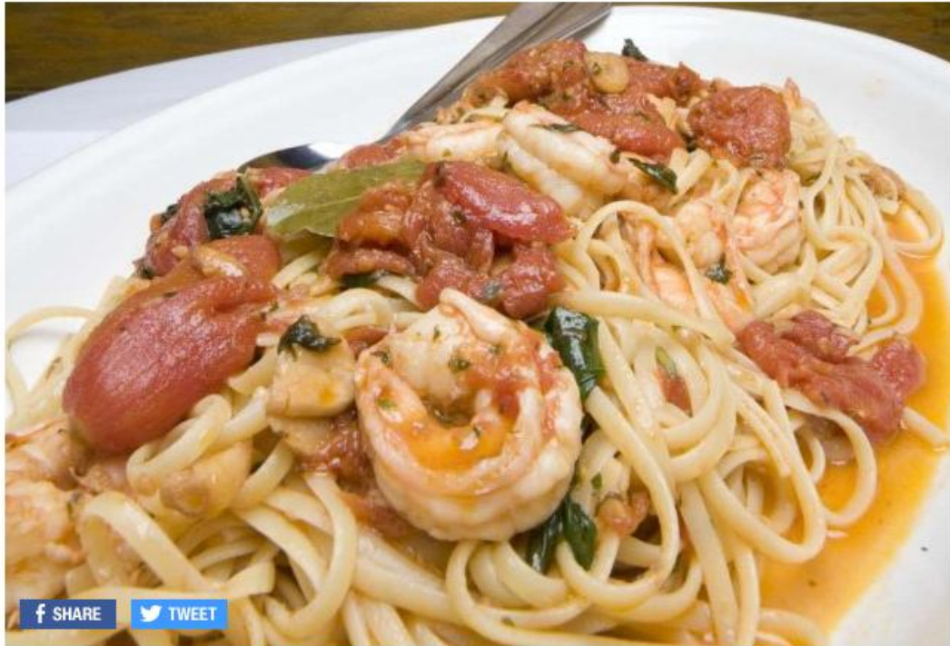
The red shrimp sauce on this linguine doesn't refer to a short person from the Helen Mirren film.